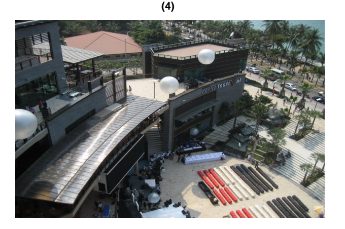
Figure 5: The back of the shopping mall faces towards the city along 120 meters of the Pattaya Sai 2 Road